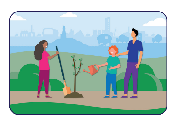
CLIMATE CHANGE & NATURE RECOVERY: To restore and enhance biodiversity, tackle the causes, and reduce the impact of climate change.