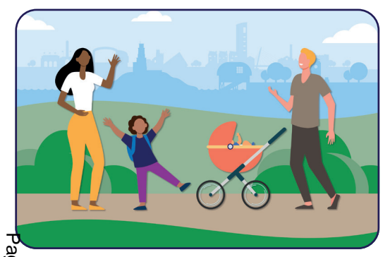
EARLY YEARS: To ensure that children have the best start in life to be the best they can be.

We want to build on successes to date so have updated our existing long-term objectives. This strategic continuity will help us focus on the joint action needed to make the most difference to individuals' lives.